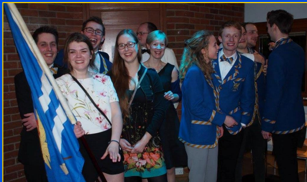
Seven generations of Men's and Women's captains gathered at Lents BCD

With a collection of new members from recent years and further back, the inaugural meeting of the Pegasus BC committee was held to coincide with the Lent Boat Club Dinner. The