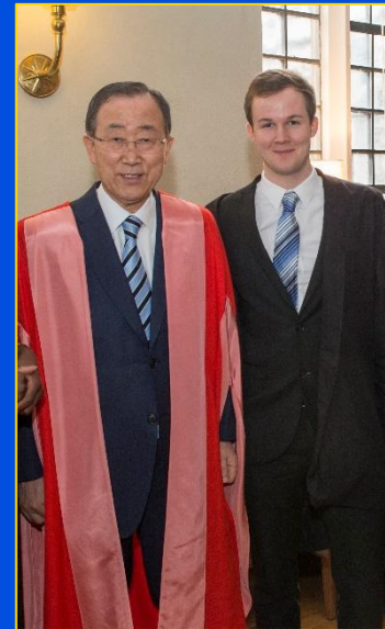
Meeting Ban-Ki Moon, UN secretary general, as a representative of CDI.

Over the last two years of university I worked for an entirely student-founded and student-run international development organisation called Cambridge Development Initiative (CDI). The initiative runs four projects (Engineering, Education, Health, and Entrepreneurship) in Dar es Salaam, Tanzania, one of the fastest growing cities in the world. To highlight my initial work in the organization, I helped implement the world's first biogas-producing simplified sewerage network for the slums of Vingunguti. We replaced the pit-latrines of around 150 residents with brand new, functional pour-flush toilets which channel into our low-cost sewage system. The waste is then converted into burnable biogas and fertiliser in a bio-digester.