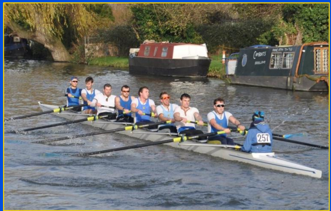
The Mighty RCBC Alumni crew at Fairbairn's delivering a second place finish!

As I'm sure many of you will know, the past 12 months has also seen a transformation in the Robinson College Boat Club's alumni society. Following on from the discussions of previous years, the RCBC committee and a number of alumni have worked to redevelop the structure of the alumni society, relaunching it as the new Pegasus Boat Club.